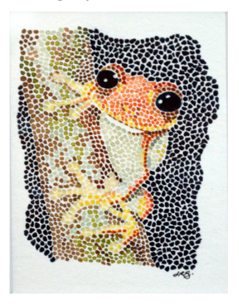
"Untitled" by Jen Ross Brown

A gorgeous, tiny, mosaic like painting, depicting a frog. Demonstrates a unique and unexpected use of watercolour, delicately and systematically applied.