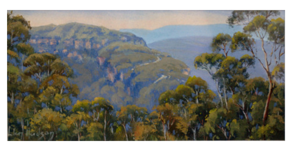
"Narrowneck - Katoomba" by Helen Hudson

A beautiful and astonishing depiction of a vast, monumental landscape, in a small painting. Skilful use of the medium, and of atmospheric perspective.