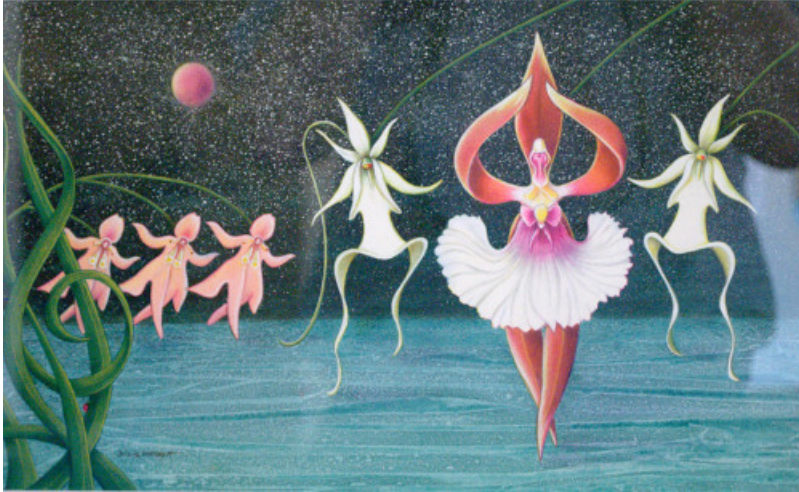
First: "Ballet Of The Orchids" by Dixie Willmott

Fantastic creativity and skill. Great showcase of different uses of the medium and expertly executed.