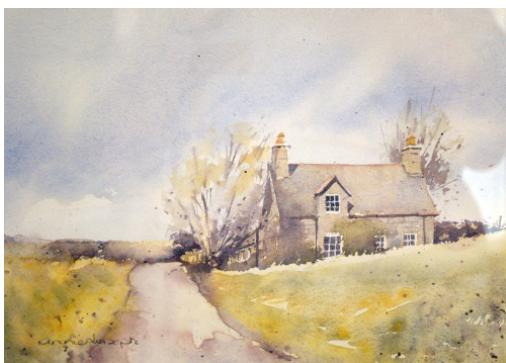
Commended: "Scottish Cottage" by Annie Joseph

Exceptional piece exhibiting great skill and delicacy. Beautiful sense of composition.