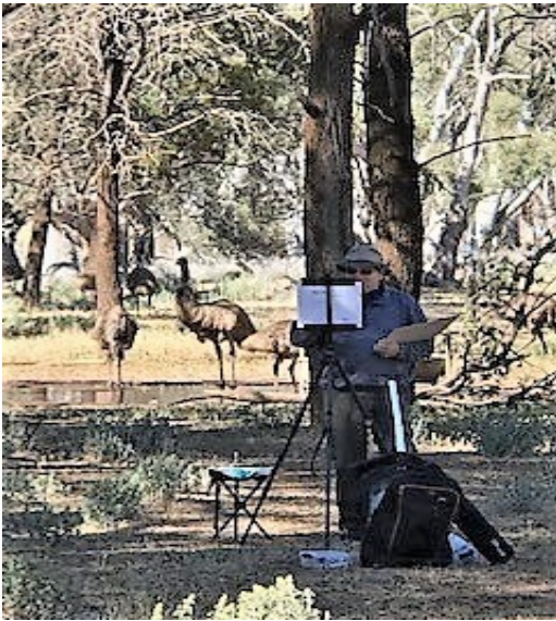
Painting with Emus