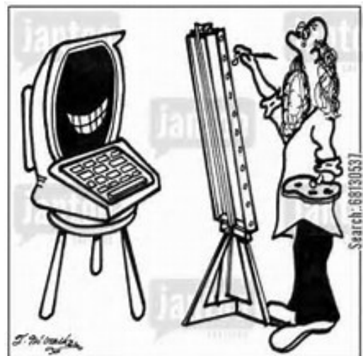
Master Artists' Computer Graphics: Leonardo da Vinci's "Mac Lisa."